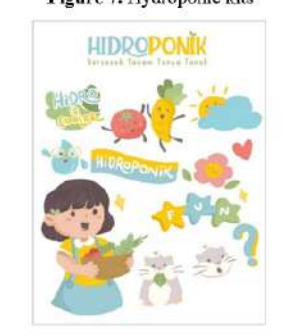
Figure 9. Sticker