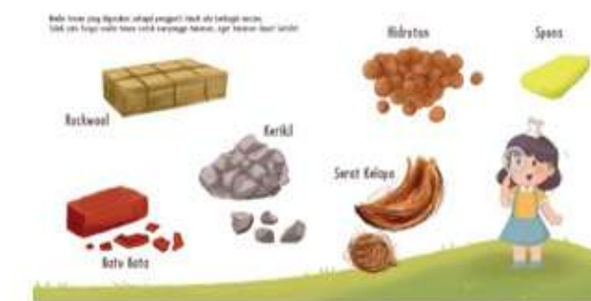
Figure 4. Picture Storybook Contents 02