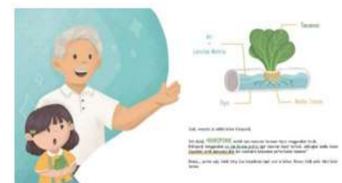
Figure 3. Picture Storybook Contents 01