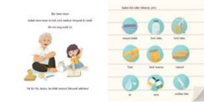
Figure 5. Picture Storybook Contents 03