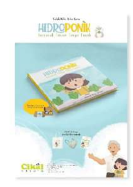
Figure 6. Poster