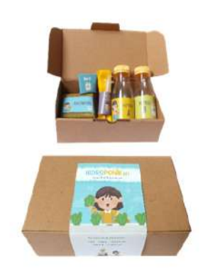
Figure 7. Hydroponic kits