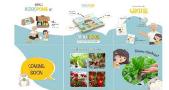
Figure 10. Social Media Ads